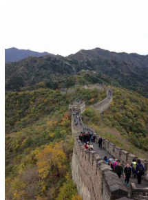
Charlotte Ward, along with four other Team GB mates, has been competing in the Park World Tour in China.

Copyright © 2016 HALO. All rights reserved.