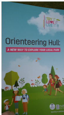
New POC Brochure