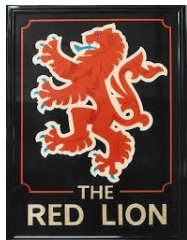
Pub League tonight...

But by their actions, they just proved the point really.