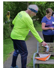
hi-viz and headtorches.

Copyright © 2018 HALO, All rights reserved.