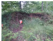
Oli & Lyra putting out controls at Normanby